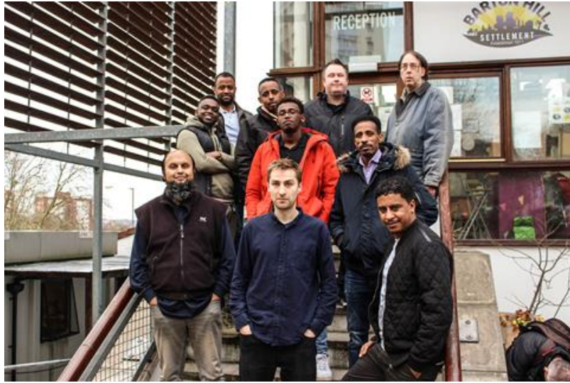
ACH trainees take their first step on a new career path