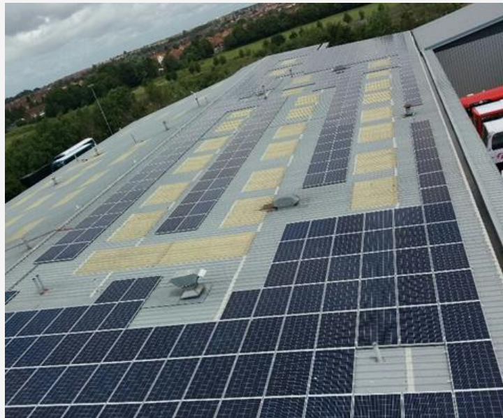
Solar panels installed at Hengrove depot