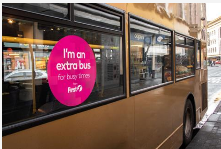
'Queue Buster' buses were deployed at peak travel times